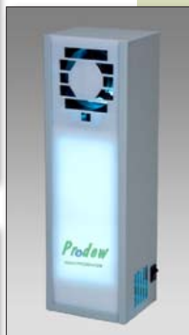
Titan Plus 3000 Wall Mounted or Free Standing

Ideal for produce, meat, and seafood storage space, wineries, offices, food processing and beverage bottling facilities