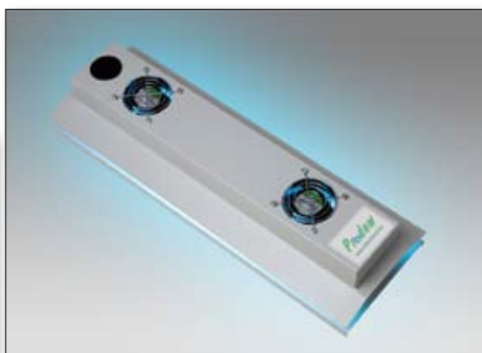
Titan Plus 8500 Ceiling Mounted