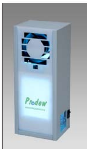
Titan Plus 2000 Wall Mounted or Free Standing